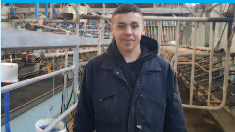
Farm Worker, Assistant Herdsperson