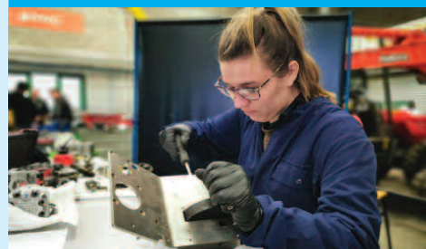
Grounds Care / Dealership Mechanic