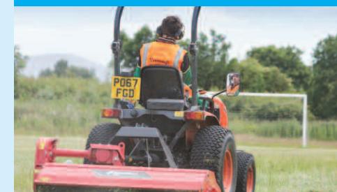
Grounds staff within Football, Rugby, Cricket, Tennis and other sports venues